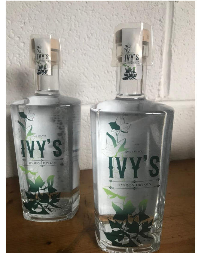
IVY's was our first contract gin, a clear front label and matching printed tamper-strips on a decanter style bottle.