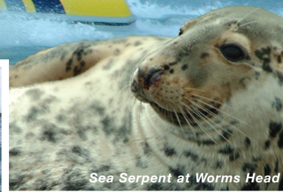
Sea Serpent at Worms Head