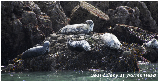
Seal colony at Worms Head

Experience fantastic wildlife encounters on our round trip from beautiful Oxwich Bay to magnificent Worms Head, the tidal island at the western tip of Gower. Along the way we hug the coastline taking in Gower's stunning scenery from a unique perspective. Listen to stories about historic caves and smugglers haunts. Keep an eye out for the regularly seen harbour porpoise and playful common dolphins amongst diving gannets. At Worms Head delight in the sights and sounds of hundreds of seabirds during nesting season, seals basking on the rocks or dozing in the water and the chance to experience the spectacular blowhole at high tide.