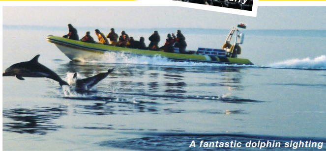
A fantastic dolphin sighting

Feel free to call & enquire, we are open to your suggestions.