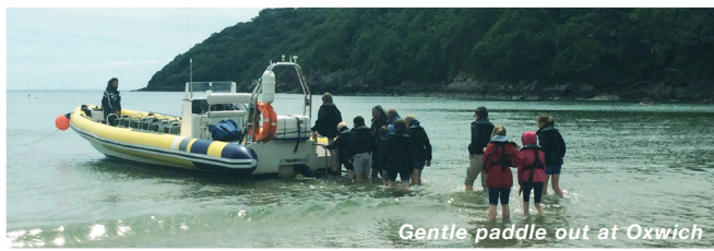
Gentle paddle out at Oxwich

Experience fantastic wildlife encounters on our round trip from beautiful Oxwich Bay to magnificent Worms Head, the tidal island at the western tip of Gower. Along the way we hug the coastline taking in Gower's stunning scenery from a unique perspective. Listen to stories about historic caves and smugglers haunts. Keep an eye out for the regularly seen harbour porpoise and playful common dolphins amongst diving gannets. At Worms Head delight in the sights and sounds of hundreds of seabirds during nesting season, seals basking on the rocks or dozing in the water and the chance to experience the spectacular blowhole at high tide.